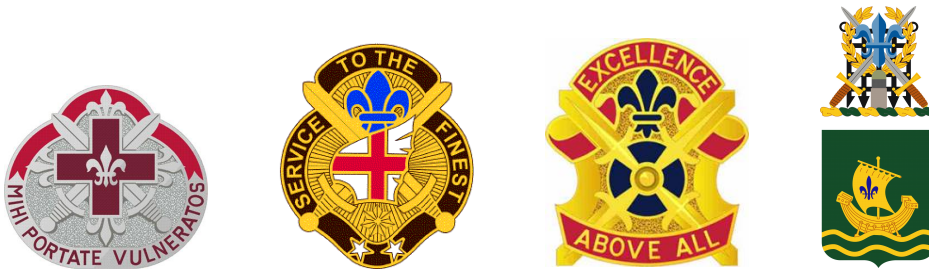
Figure 2. Examples of emblems with two crossed swords and a lily flower. From left to right: The Distinctive Unit Insignia of the Combat-Support-Hospital. The Distinctive Unit Insignia of the MEDDAC Carlisle Barracks. The Distinctive Unit Insignia of the Replacement Battalion. The Coat of Arms of the Military Police Battalion.