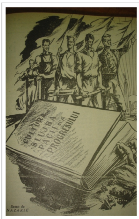
Flacăra (1948) on the appropriation of culture by the political ideologies: “Culture in service of peace and progress”.

explain in a schematic, wooden language, all levels of reality. Culture was meaningless – within this system – unless it had a function ( The function – to legitimise and “serve” power). It was meant just to “show” the communist reality (usually a stereotypical description of utopian characters and facts – constructed and legitimated themselves by the purpose of “building” a new society and the “new man”) and embody ideological principle (class struggle and so on), following a Marxist background. “Marx uses a three-factor notion of ideology, as falsity, role, and isomorphism. For him an ideology is not a new object or symbol, but a way of examining cultural creations along specific dimensions and an attempt to relate these creations to a specific social base. ” (Huaco, 421-422)