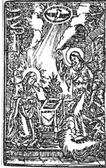
I[oanițiu] E[ndrédi], Annunciation (woodcut), Acatistiariu , Blaj, 1763