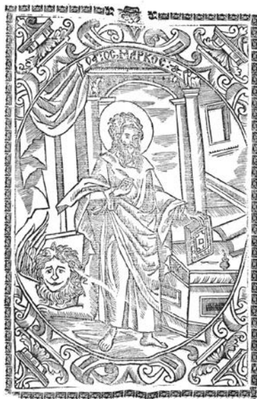
[Antim Ivireanul], Mark, the Evangelist (woodcut), Greek-Romanian Gospel , Bucharest, 1693