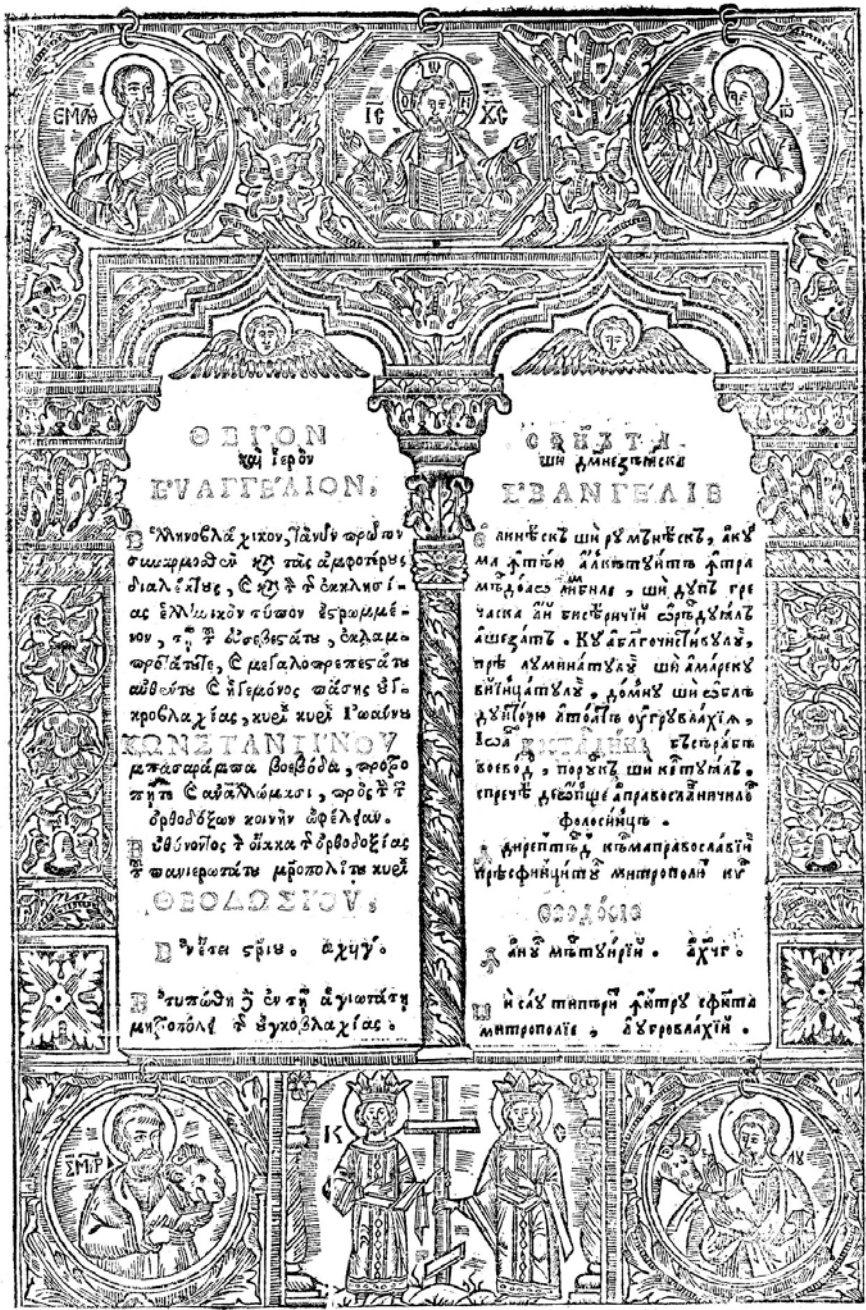
[Antim Ivireanul], Frame of the Title Page (woodcut), Greek-Romanian Gospel , Bucharest, 1693