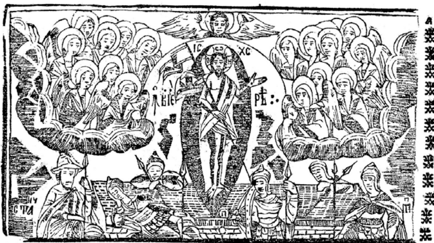
Stanciul Tipograf, Resurrection (woodcut), Apostle , Bucharest, 1784