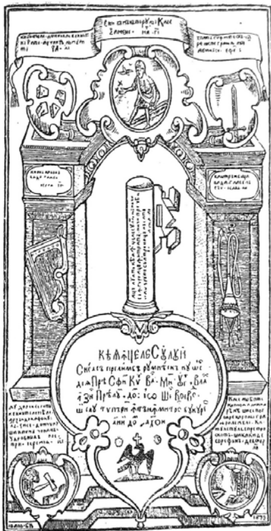
Ivan Bakov, 1678, Frame of the title page (woodcut), The Key to Meaning , Bucharest, 1678