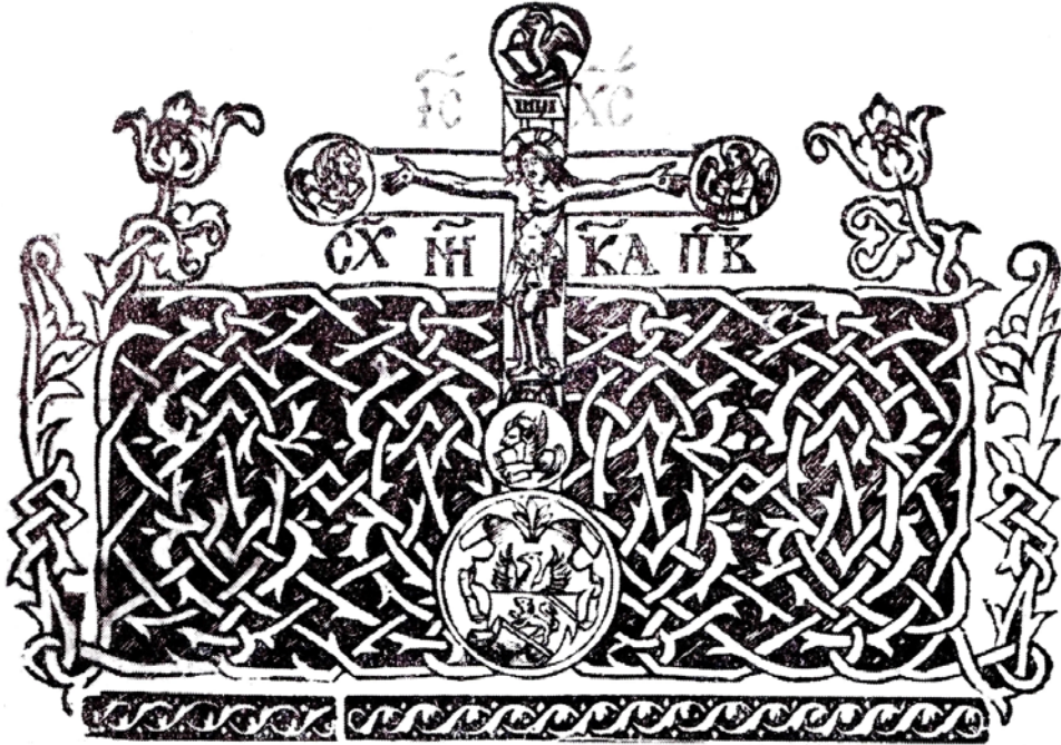
Frontispiece with Crucifixion (woodcut), Menaion of Feastdays of Božidar Vucović, Venice, 1538