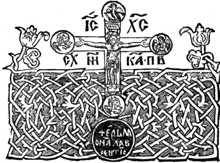
Ieromonah Lavrentie, Frontispiece with Crucifixion (woodcut), Slavonic Tetraevangelh , Monastery of Plumbuita (Bucharest), 1582