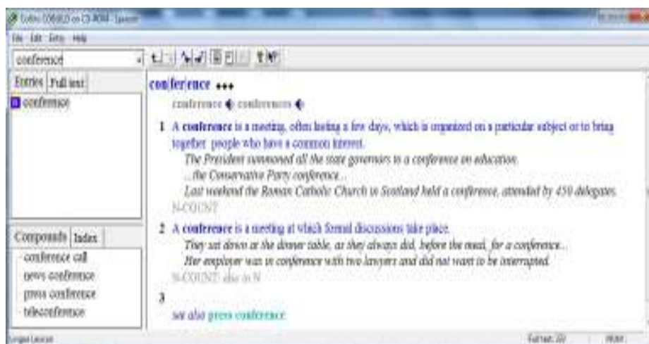
Figure 1: the English context for ‘conference’

It is obvious from the context in Example 3 above that a meeting of chiefs or leaders of Arab governments is intended, thus the latter rather than the former should be used. A cursory look at Figure 1 and Figure 2 below shows how ‘conference’ and ‘summit’ are used within English context through a number of authentic examples in italics.