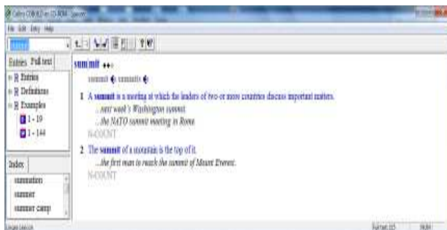
Figure 2 the English context for ‘summit’

Figure 2 implies high-profile people, top leaders etc., thus ‘summit’ should be used.