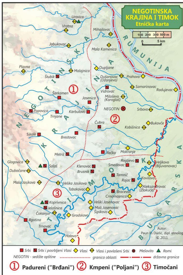
Figure 3. Detailed interactive map of the Negotinska krajina and Timok regions ( http://www.paundurlic.com/vlaski.recnik/mapa-timoceni.php )

The author categorizes the Vlachs, according to the geographical areas of North-Eastern Serbia they inhabit, into three main groups: 1) Eastern, 2) Central and 3) Western Vlachs. The linguistic groups presented on the map are: Ungureni (Bănăţeni) Vlachs, Munteni (Bănăţeni) Vlachs, Ţărani (Olteni) Vlachs, Bufani Vlachs, Bayash (Romanian speaking Roma) and Serbs. By clicking on one of the 17 sub-regions on the map, one gets more detailed micro-maps, with further categorizations of the Vlachs (as we can see from Figure 3 – Pădureni, Câmpeni, Timoceni , for example, in the Negotinska krajina and Timok regions), a complete network of settlements, and the possibility to click on them and to visualize the entire lexicographic material collected there or connected with that particular place (see Figure 4).