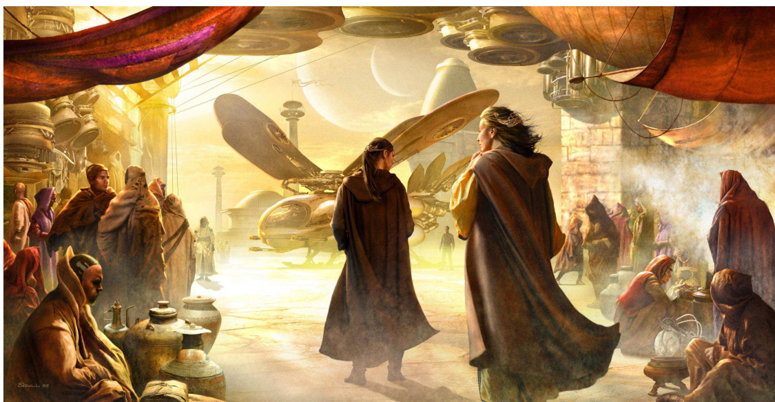
Alia and Jessica Atreides