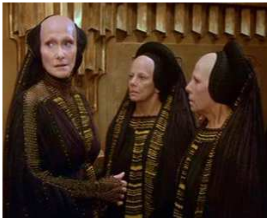
Alia Atreides The Bene Gesserit